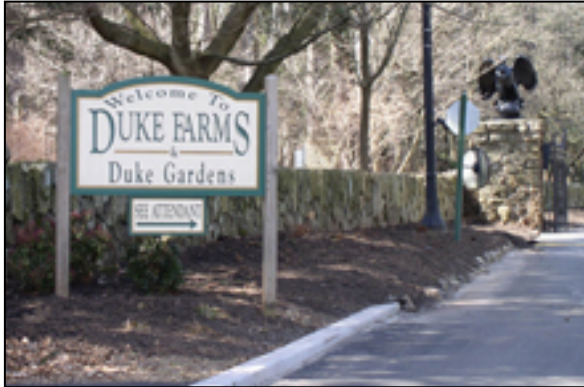
Duke Farms Entrance off Route 206 South

From: New York and East • Philadelphia and South Points North and West • NJ Turnpike