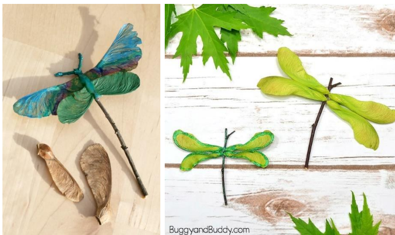
Dragonfly Craft from Buggy and Buddy

The dragonfly wings are made from seeds that originate from the maple tree. They are called samaras .