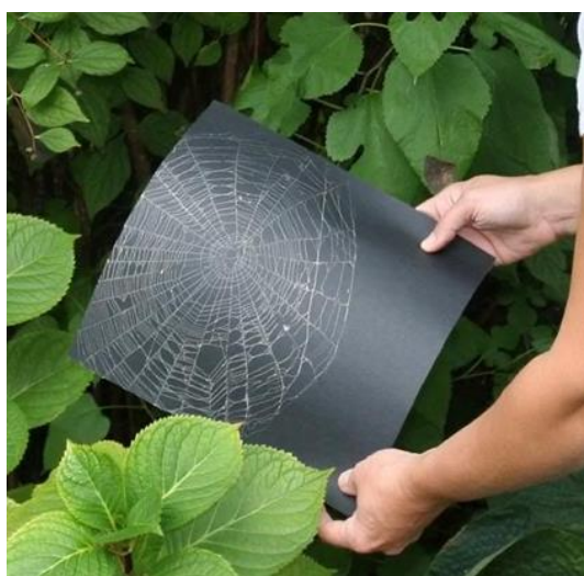
Preserving Spiderwebs from Club Scrap Creates