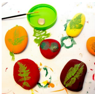
Leaf Printing on Rocks from Projects with Kids

You can print on various surfaces as well, such as rocks or clay!