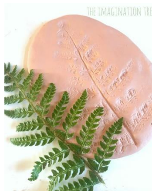
Leaf Printing on Clay from The Imagination Tree