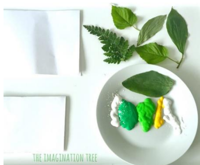
Leaf Printing Art from The Imagination Tree

You can paint directly onto a leaf and press it onto paper or place a leaf underneath a paper and rub a crayon on top of the paper!