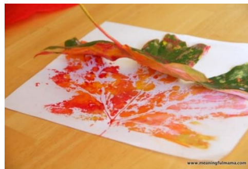
Leaf Prints with Paint from Meaningful Mama

You can print on various surfaces as well, such as rocks or clay!