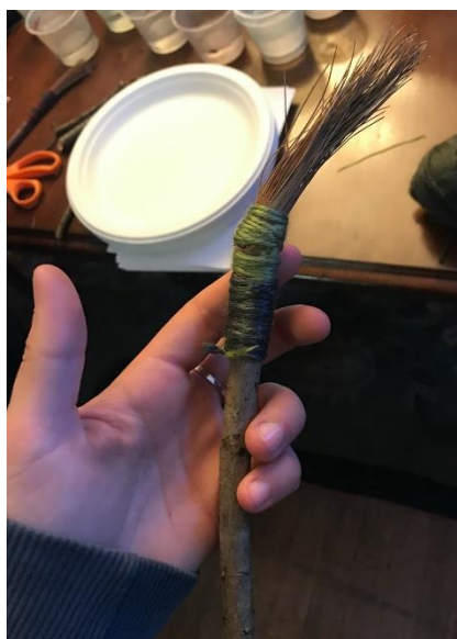
Nature Paint Brush by Meghan Martin

Bonus: Try using different plants to observe the various textures and strokes they make with paint.