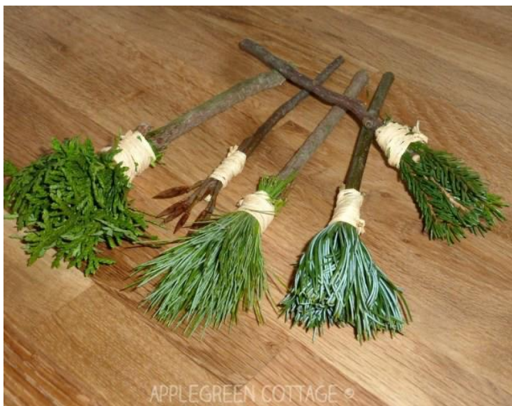
Nature Paint Brushes from Apple Green Cottage