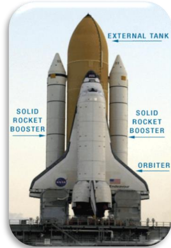
NASA - Fully loaded space shuttle weighs approximately 4.5 million pounds.

An action as simple as wrapping a gift can create an enormous amount of waste. It is estimated that in the U.S. alone, we produce 4.6 million pounds of wrapping paper each year. That is about as much as a fully-loaded space shuttle weighs! In addition to the sheer amount being produced, many recycling facilities cannot recycle wrapping paper depending on the material(s) from which it is made. Be sure to check with your local recycling facility to see what items you can and cannot recycle curbside. Greeting cards are another common item purchased and given when gift-giving. Within the United States, we purchase 7 billion greeting cards each year. How can we change our gift-wrapping habits to benefit ourselves and the environment?