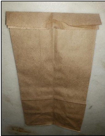
Instruction #1 - this is now the back of the bag