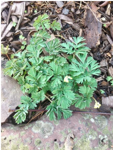
Note: all photos are from J. Vogel garden and woodland