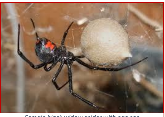
Female black widow spider with egg sac

Black widow. Just the thought of this patent leather looking arachnid can conjure fear in the hearts of even the most intrepid souls. Despite its small size (just a ¼ in. in diameter and an inch and a half from one leg tip to another), its reputation as one of the world's most venomous spiders is legendary. The black widow spider's venom is reported to be 15 times stronger than that of a rattlesnake. While there are more than 30 species of black widows worldwide, only two species (the southern, Lactrodectus mactans and the northern, Lactrodectus variolus ) are found in New Jersey. Both are black with red hourglass markings on their abdomens. The major difference is that shape of the hourglasses varies slightly on each of them.