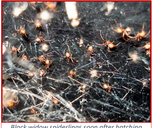
Black widow spiderlings soon after hatching

Black widows get their name because the female sometimes kills and eats the male after mating. Scientists theorize the cannibalism occurs so that the female gets an extra source of protein to benefit the offspring developing inside her. The female lays her eggs in cocoons of